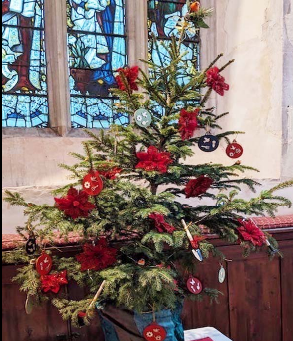
27 Horticultural Society