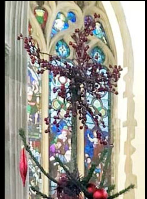
26 St James' Christmas Tree