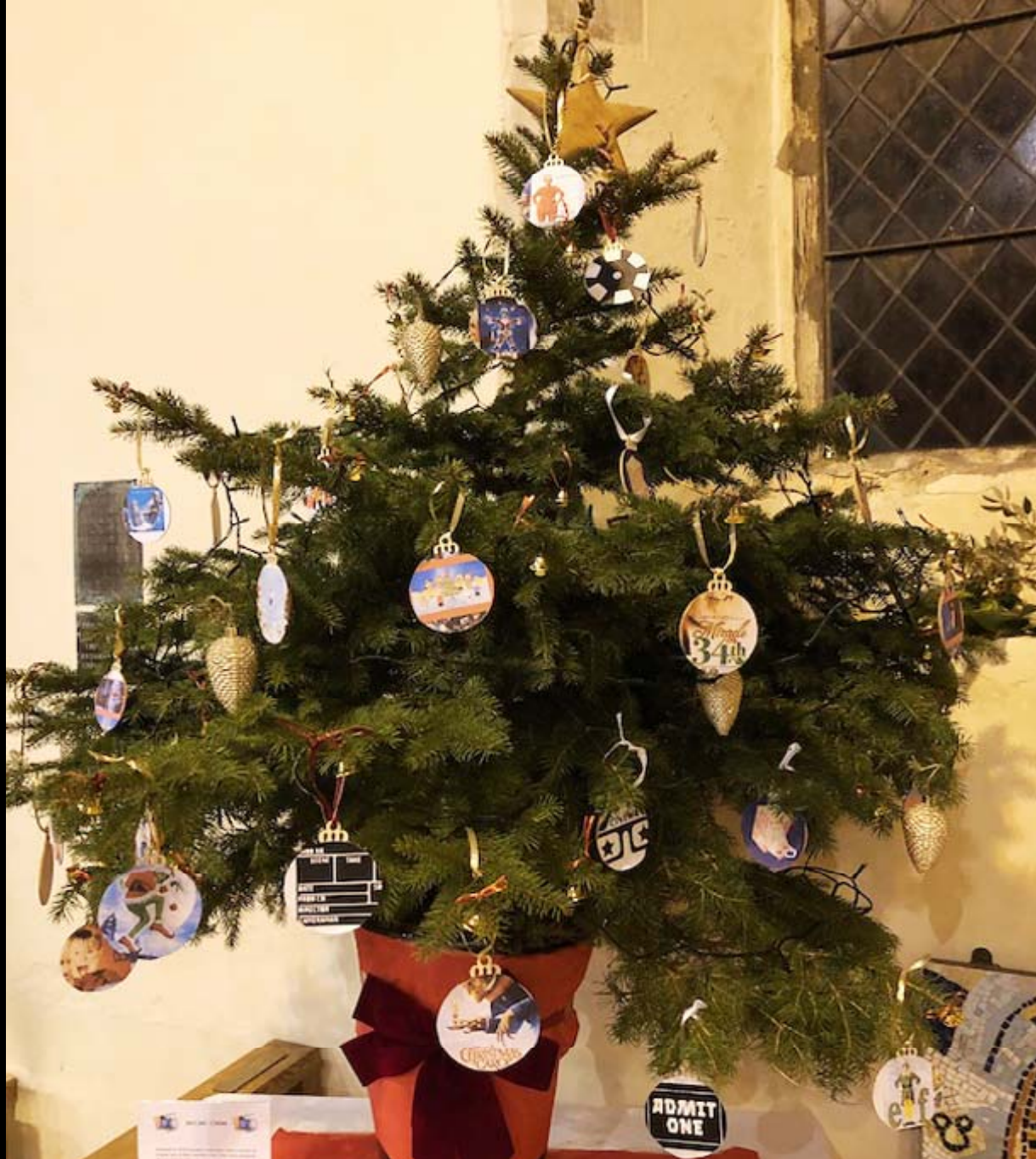
8 Nayland Cinema