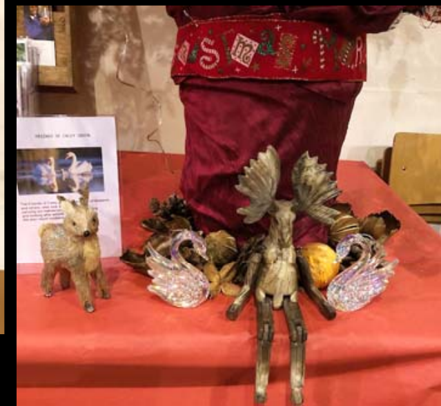
5 Friends of Caley Green