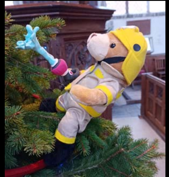
17 Nayland Firefighters