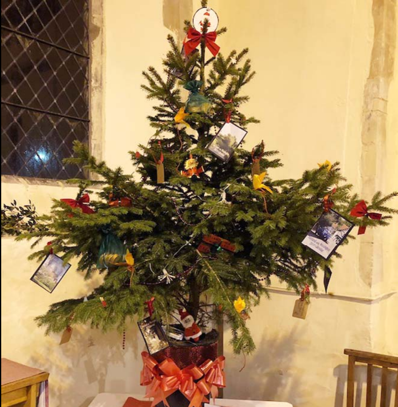
9 Nayland with Wissington Community Council