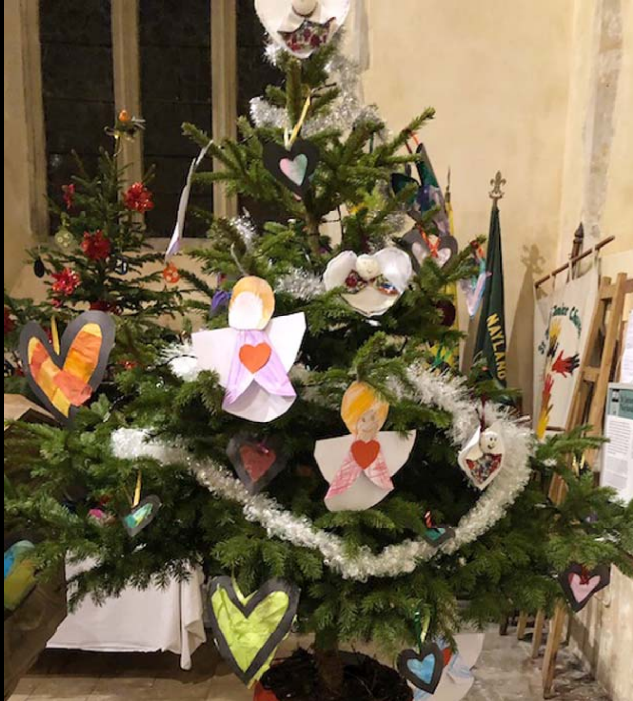
25 Stoke by Nayland C of E Primary School & Nursery