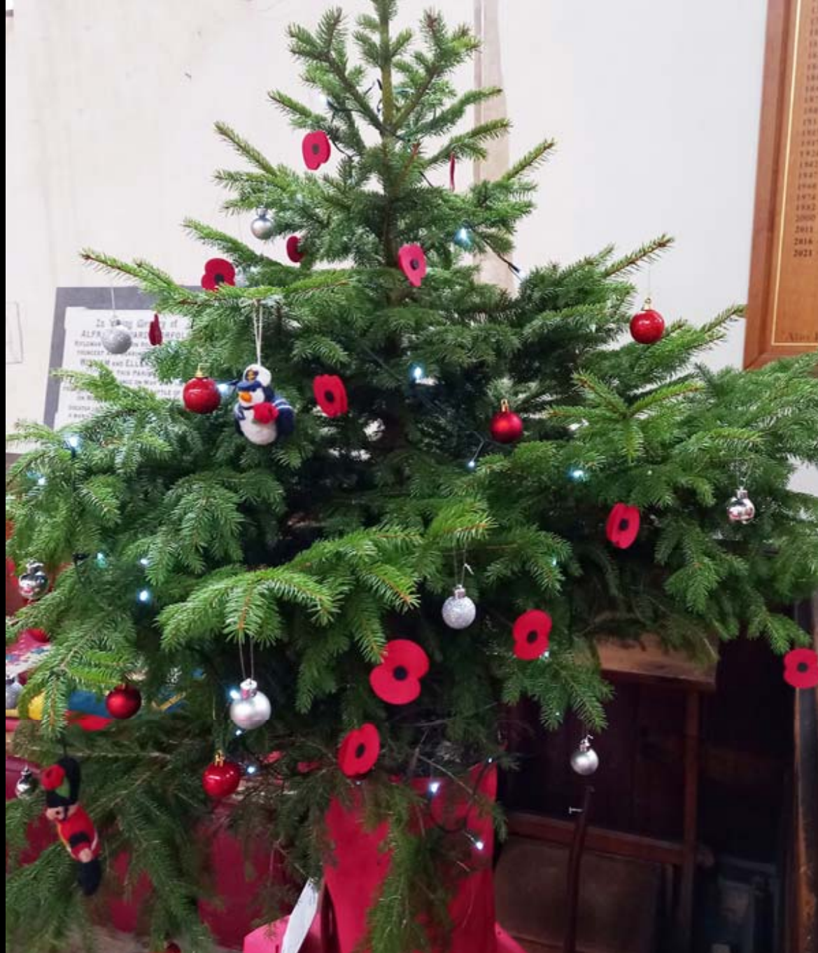
21 Royal British Legion