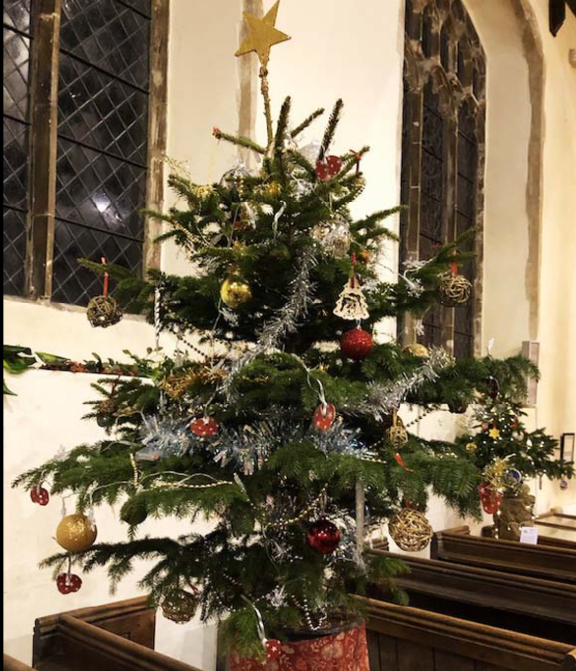
6 Church Flower Arrangers