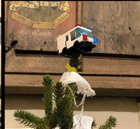
15 Nayland First Responders