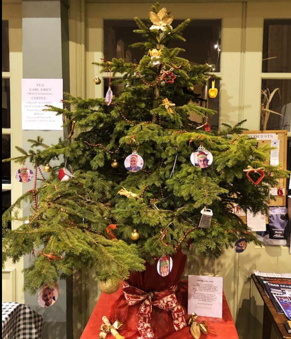
3 St James' Coffee Morning