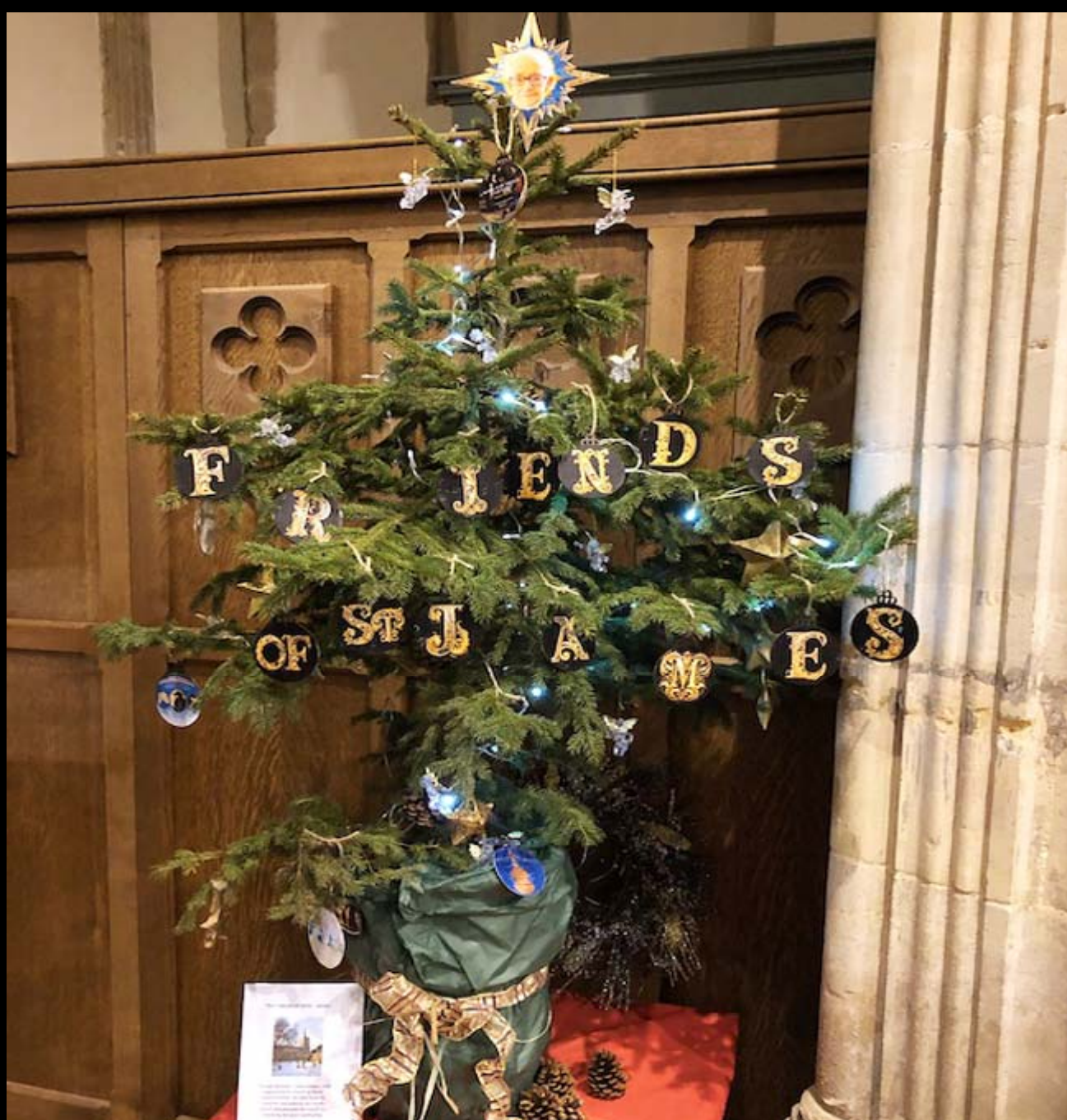
1 Friends of St James' Church