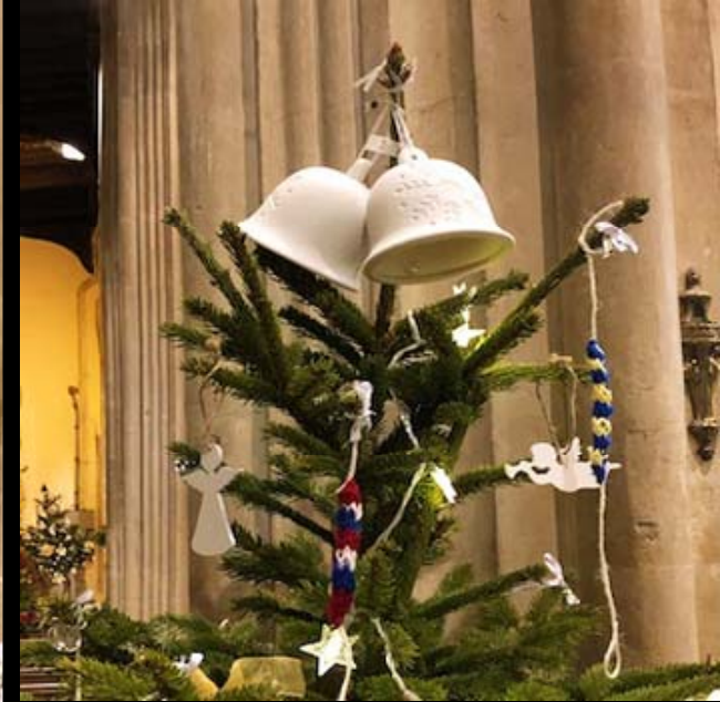
4 St James' Bellringers