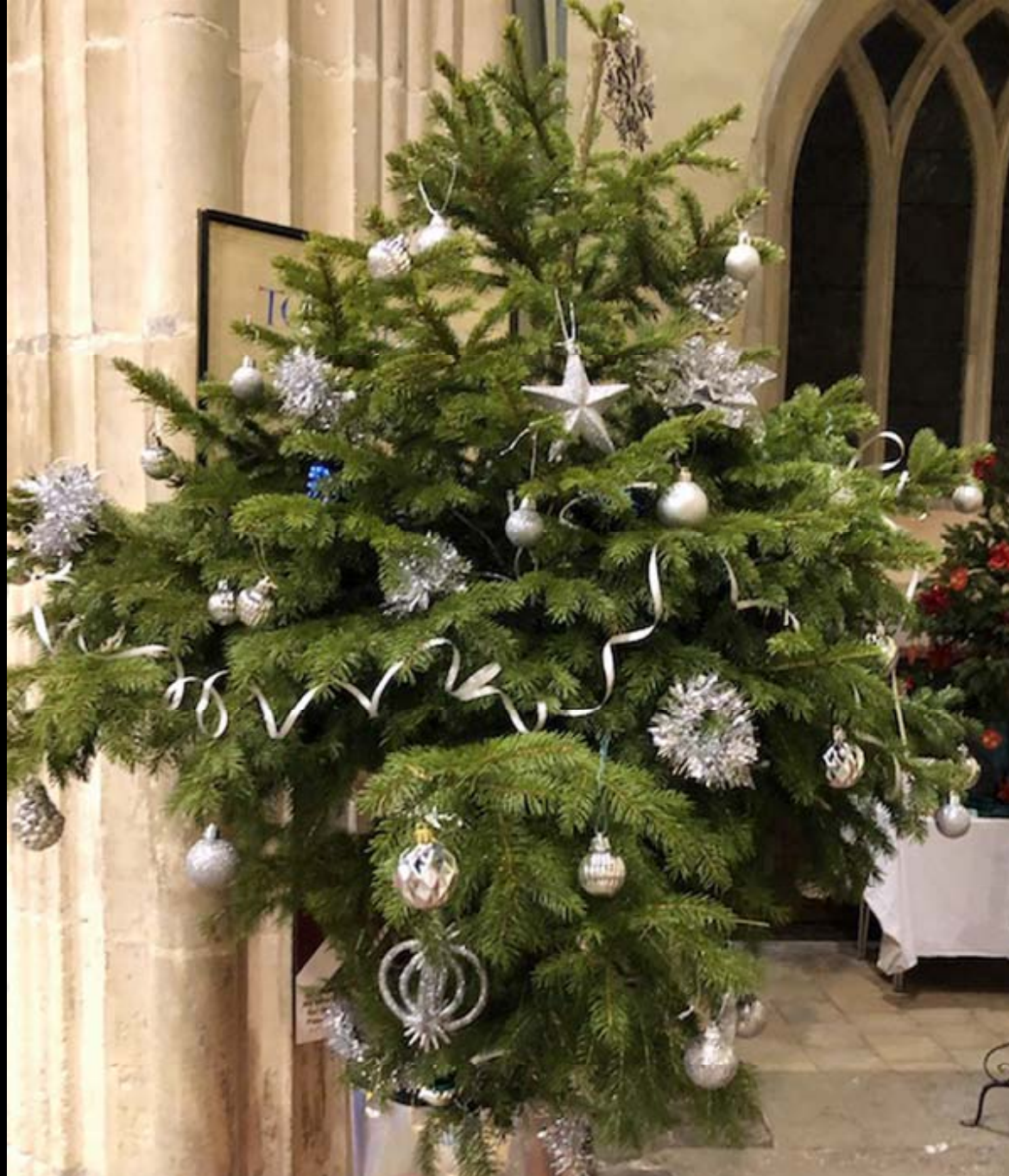
23 Nayland Womens' Institute