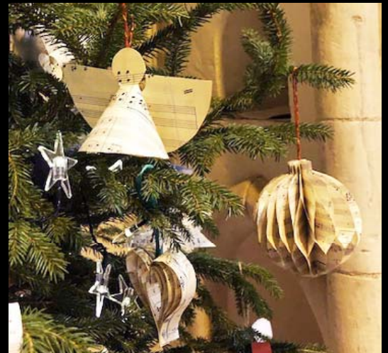
10 Nayland Choir