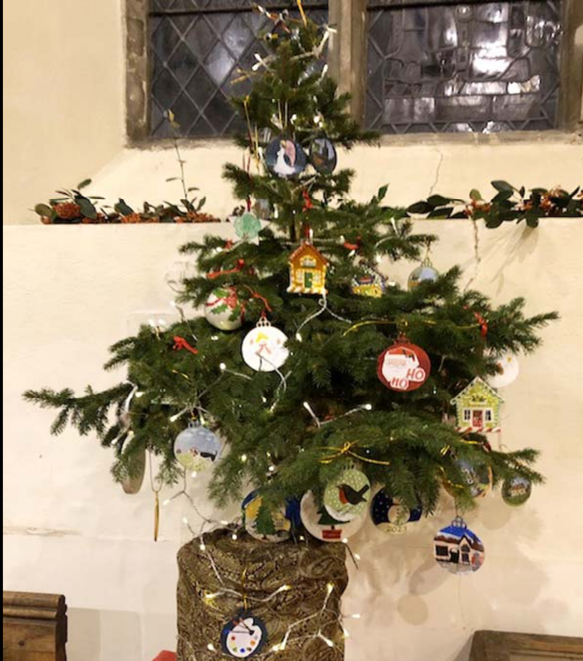
7 Nayland Art Group