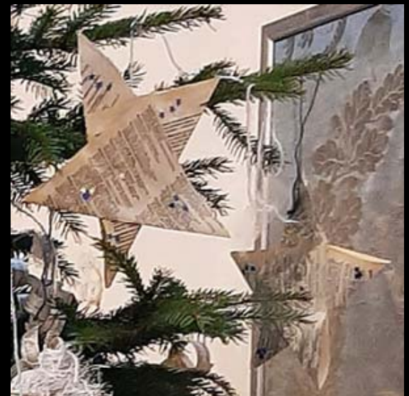
13 Nayland Primary School