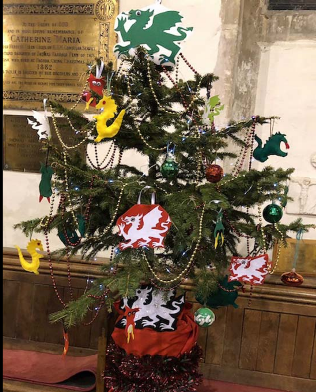
18 St Mary's Church, Wiston