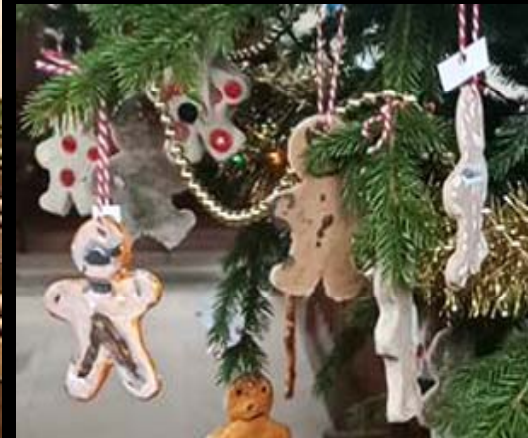
12 Woodland Corner – Nayland Playgroup