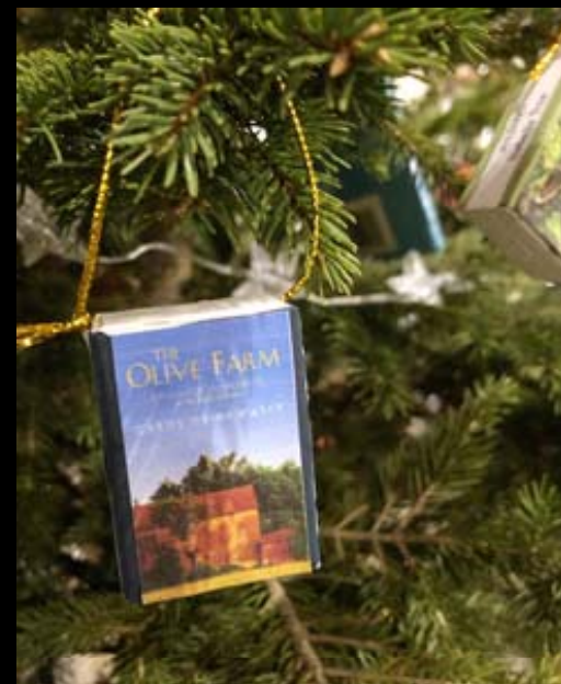
20 Nayland Book Club