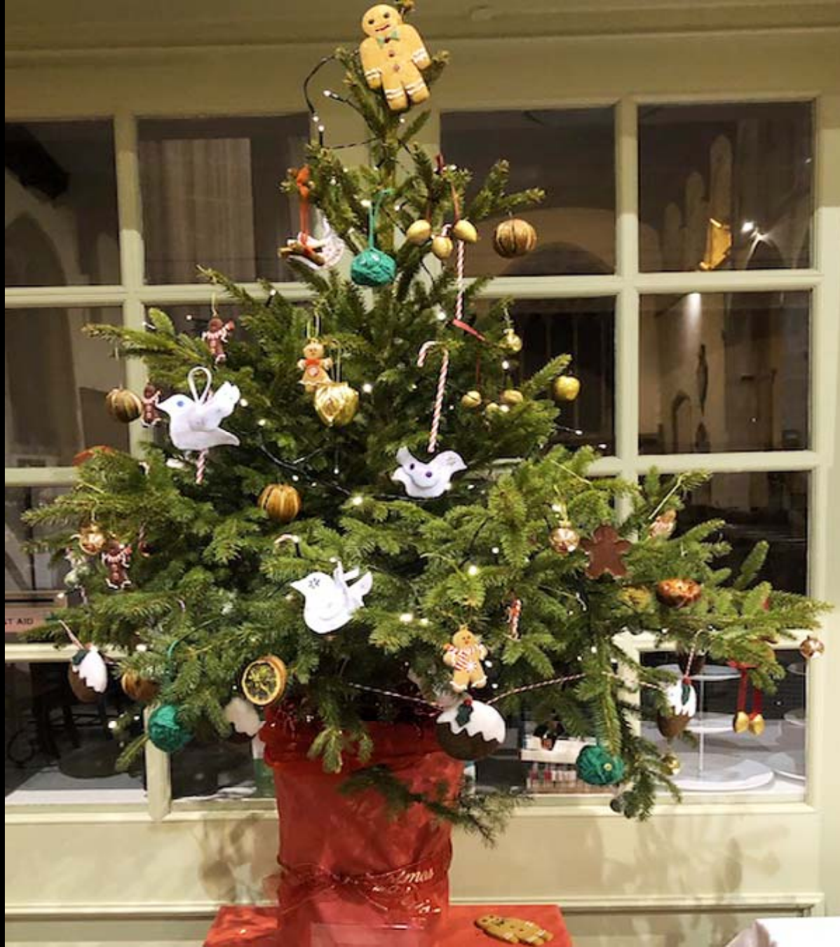
2 Nayland Village Lunch